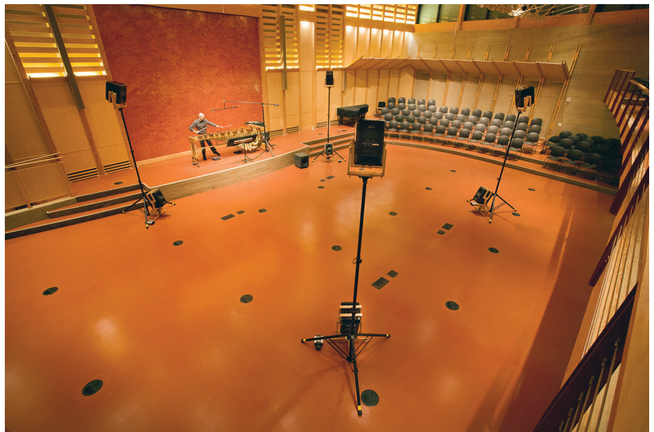
Nathaniel Bartlett's live setup

With Bartlett’s tracking system, the computer can be instructed to ignore all gestures beyond a pre-determined threshold. Therefore, the computer does not track ordinary performance gestures to manipulate sound; tracking commences when mallets exit the designated “marimba space.” Tracking is based on the order of appearance of mallets, each of which is assigned a uniquely colored crosshair. Bartlett sees a mirror image of himself in this virtual (infrared) representation, allowing him to execute gestures in a